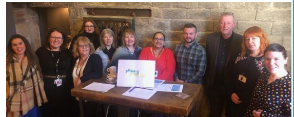
Boo Consulting and Bolton Employers

On November 13th we partnered with Boo Consulting, a Living Wage Employer in Bolton to hold a Living Wage networking session. We attended the event along with 10 Bolton employers, some of whom are already Living Wage Employers and others who wanted to know more. The event was a great success and we will be working with colleagues in Bolton to work towards Bolton becoming a Living Wage Place.