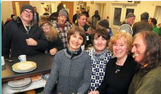
Cornerstone Day Centre

Since the start of this summer, I have been making weekly donations of organic fruit and vegetables to a homeless day centre in south Manchester. I live in Urmston and have an allotment at Humphrey Park Allotments in Stretford, a sizeable self-managed site with 80 or so plots in total. I grow all sorts – plenty to sustain my family – and the idea of donating surplus produce was sparked after I received a free polytunnel (essentially a lo-fi greenhouse), which has allowed me to extend the growing season and increase the amount I can produce.